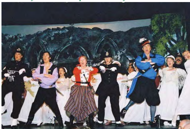
A scene from our last production of 'Pirates'

Tickets can be ordered from the Society Box Office on 01252 834380 or Camberley Theatre on 01276 707600. Credit Card Bookings: www.camberleytheatre.biz