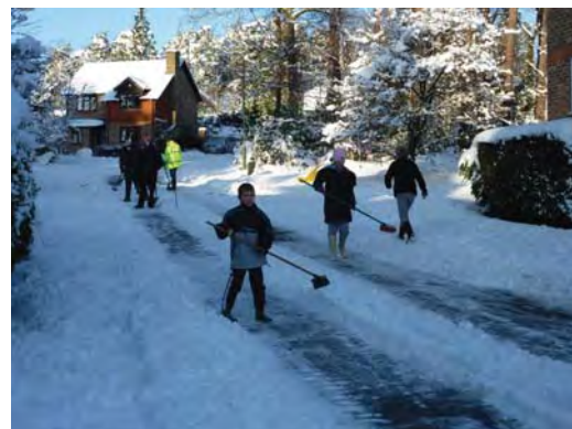
Residents of Amber Hill clearing the snow in January 2010

f. Think about the comfort and care of elderly neighbours who may not wish to venture outside.