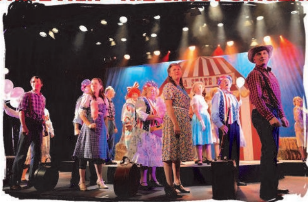
www.Facebook.com/myworldmyeyes - www.MyWorldMyEyes.co.uk