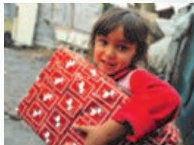
Christmas presents delivered across the world

Boxes from Heatherside waiting to be collected