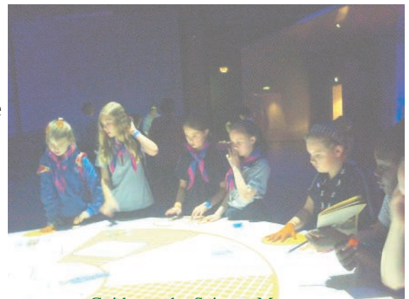
Guides at the Science Museum

They were lucky to sit and listen to a dramatised talk by an actress portraying Marie Curie. She explained how she had discovered radioactivity and its eventual role in cancer treatment. She told the girls how difficult it was in the early 20th century for women to be recognised as scientists in their own right. Her message was that young women could achieve whatever they desire if they are determined to succeed.