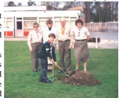
5 th April 1997- cherry tree planting to mark our 25 th anniversary year

Due to a shortage of leaders numbers fell quite dramatically and by 2003 there was only one Cub Pack (Blue) and the numbers had fallen in Scouts. But it was exciting times as this was the year that our first Beaver Colony started and Red Pack re-opened due to demand for Cub places. It was also around this time that we had our first girl member in the Group. She started with the Beaver colony and stayed right through to Scouts. Today we have girls in all our sections.