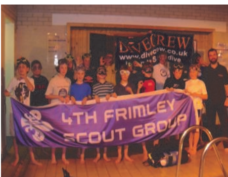
Scuba Diving 2009

We have 90 members with one Beaver Colony, Red and Blue Cub Packs and Black Troop all run by enthusiastic leaders. We get up to many exciting activities such as abseiling, archery, backwoods cooking, bowling, canoeing, carol singing, caving, climbing, cycling, donutting, dragon boating, expeditions, fire lighting, flying, geocaching, Halloween howlers, incident hikes, jousting, kayaking, knotting, laser quest, map reading, navigating, orienteering, pioneering, quiz nights, raft building, sailing, scuba diving, shelter building, skiing, snowboarding, treasure hunts, visits, wide games, exercising, yarn telling and any other zany activities we can think of!