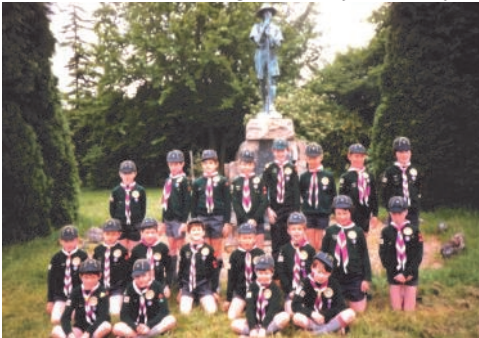
One of the Packs on holiday at Polyapes Campsite in June 1986. The boys are looking very smart in short trousers and caps!