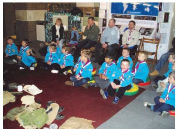
4 th Frimley Beavers at Royal Logistics Corps Museum, Deepcut