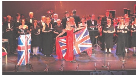
Echoes of Empire Show

The celebrations may have abated after an orgy of events over the Royal Jubilee weekend. Street parties, field events, theatre shows and a television extravaganza, with the Olympics still to come! What a marvellous time to be British! Closer to home 'Echoes of Empire' produced by Surrey Heath Arts Council at Camberley Theatre was well attended. The sales of the professionally filmed DVD are expected to increase the total raised in support of Help for Heroes and