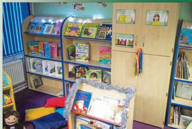
New library area stocked and ready for use

Last term we opened our revamped front reception area, complete with a fabulous new fiction library. Everyone has commented on how welcoming this space feels now. All the children love their new library, not just the wonderful range of books available to them but also the vibrancy and openness of the area. With my office door open, I can listen to amazing conversations between children discussing their favourite authors, illustrators and what their favourite story is. All this from 4 to 7 year olds!