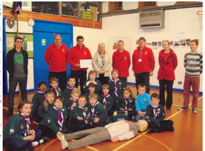
Cubs receiving their Emergency Aid badges

One of our Cub packs recently held a fundraising evening in aid of First Responders. Each group of Cubs planned and carried out activities and these included a treasure hunt, name the teddy, guess the number of sweets in the jar, tin can alley as well as a cake sale, face painting and lucky dip. They raised almost £100 and are looking forward to presenting the cheque to the charity later this month. In addition, the Cubs are working towards several badges. They spent a fun evening kayaking at Mytchett Lakes as part of their Water Activity badge, have visited Farnborough Air Science Museum as part of their Air Activity badge and are working hard towards gaining their Emergency Aid badges. Their term ended with a bowling evening followed by a meal and dancing Gangnam style around the tables!