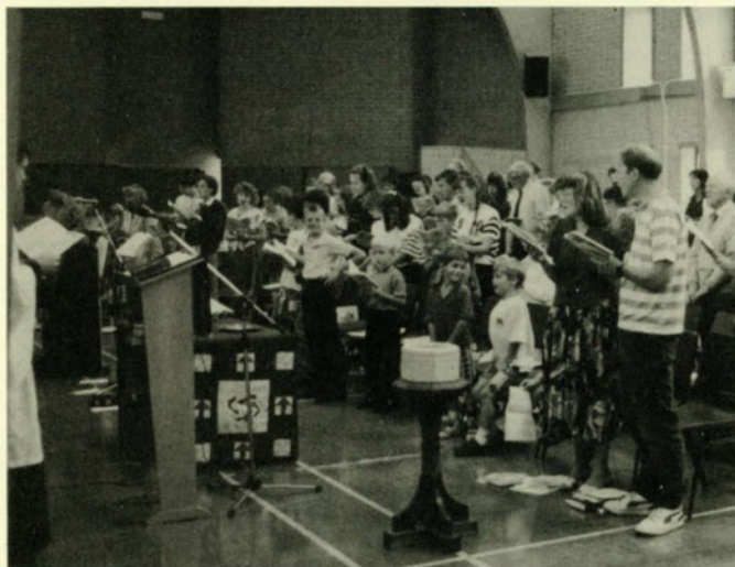
Baptism Service in The Centre