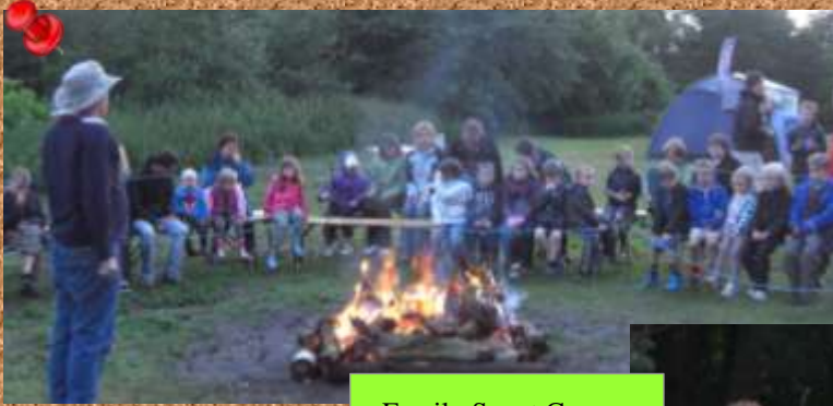
Family Scout Camp