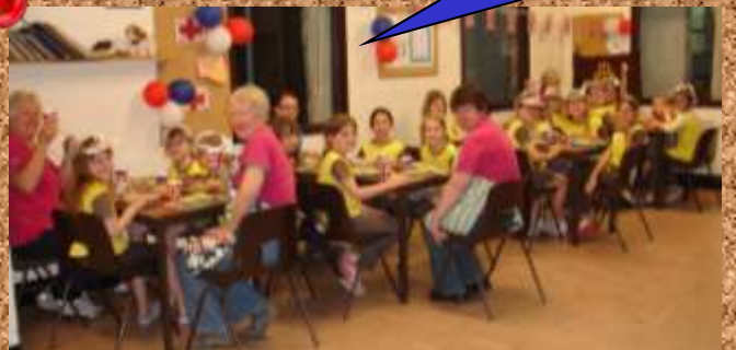
10th Camberley Brownies pack holiday