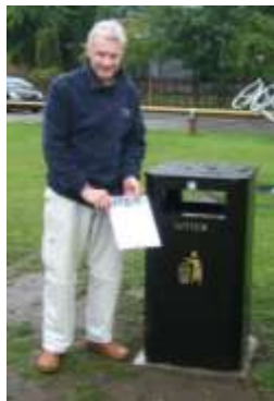
Launching Heather Ridge School's "design a bin" competition