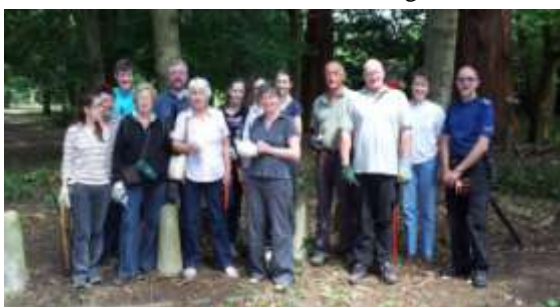
Just a few of the team take a break to pose for a photo

As well as making the area more attractive, anti-social behaviour is deterred as the police now have a better view of all areas of the green. Two large piles of brambles, nettles and branches were formed, which were soon cleared away by the local council's shredder.