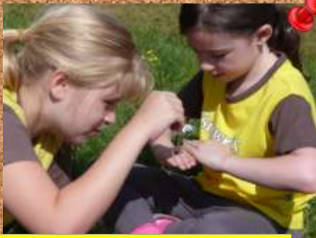
Brownies on their mini-beast holiday