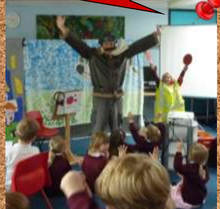
Kids Alive prepare for take off