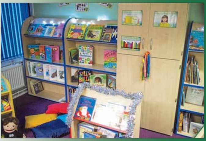
New library area stocked and ready for use

Last term we opened our revamped front reception area, complete with a fabulous library. Everyone new fiction has commented on how welcoming this space feels now. All the children love their new library, not just the wonderful range of books available to them but also the vibrancy and openness of the area. With my office door open, I can listen to amazing conversations between children discussing their favourite authors, illustrators and what their favourite story is. All this from 4 to 7 year olds!