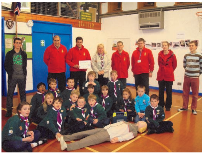
Cubs receiving their Emergency Aid badges

One of our Cub packs recently held a fundraising evening in aid of First Responders. Each group of Cubs planned and carried out activities and these included a treasure hunt, name the teddy, guess the number of sweets in the jar, tin can alley as well as a cake sale, face painting and lucky dip. They raised almost £100 and are looking forward to presenting the cheque to the charity later this month. In addition, the Cubs are working towards several badges. They spent a fun evening kayaking at Mytchett Lakes as part of their Water Activity badge, have visited Farnborough Air Science Museum as part of their Air Activity badge and are working hard towards gaining their Emergency Aid badges. Their term ended with a bowling evening followed by a meal and dancing Gangnam style around the tables!